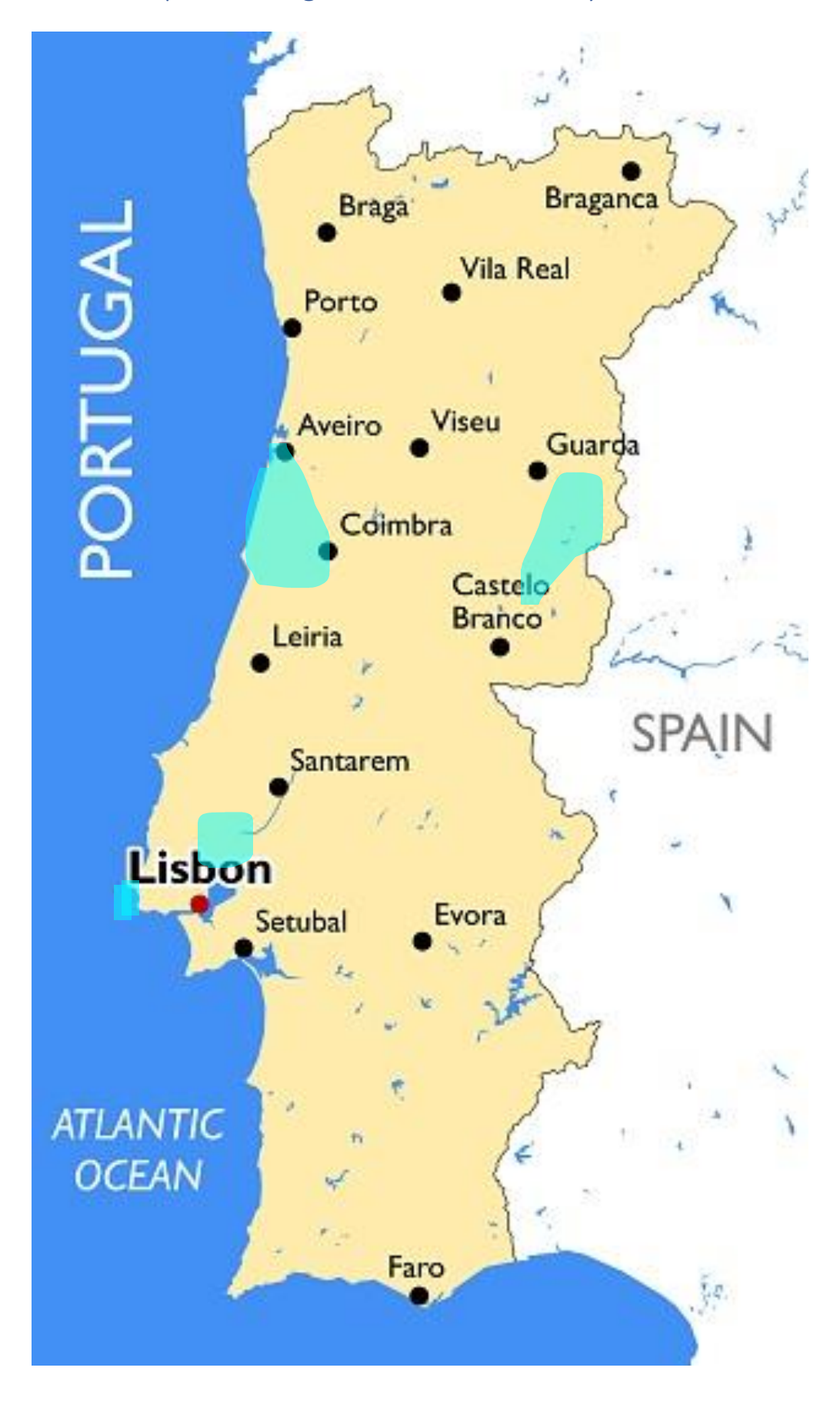
Appendix 7: Map indicating main areas visited by the 2022 VTT.