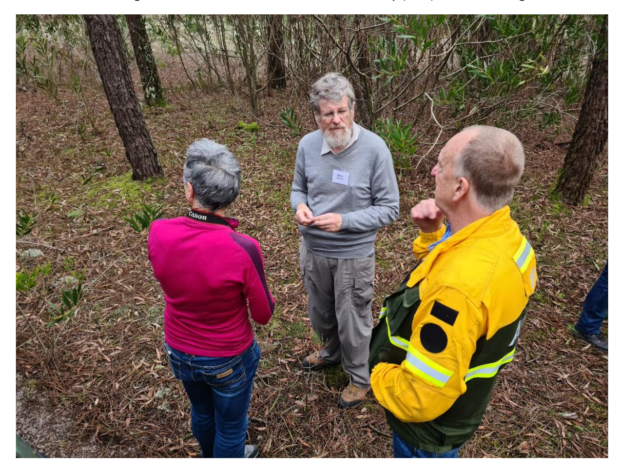
Beira Litoral, Portugal.