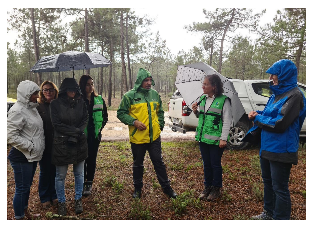
Beira Litoral, Portugal.