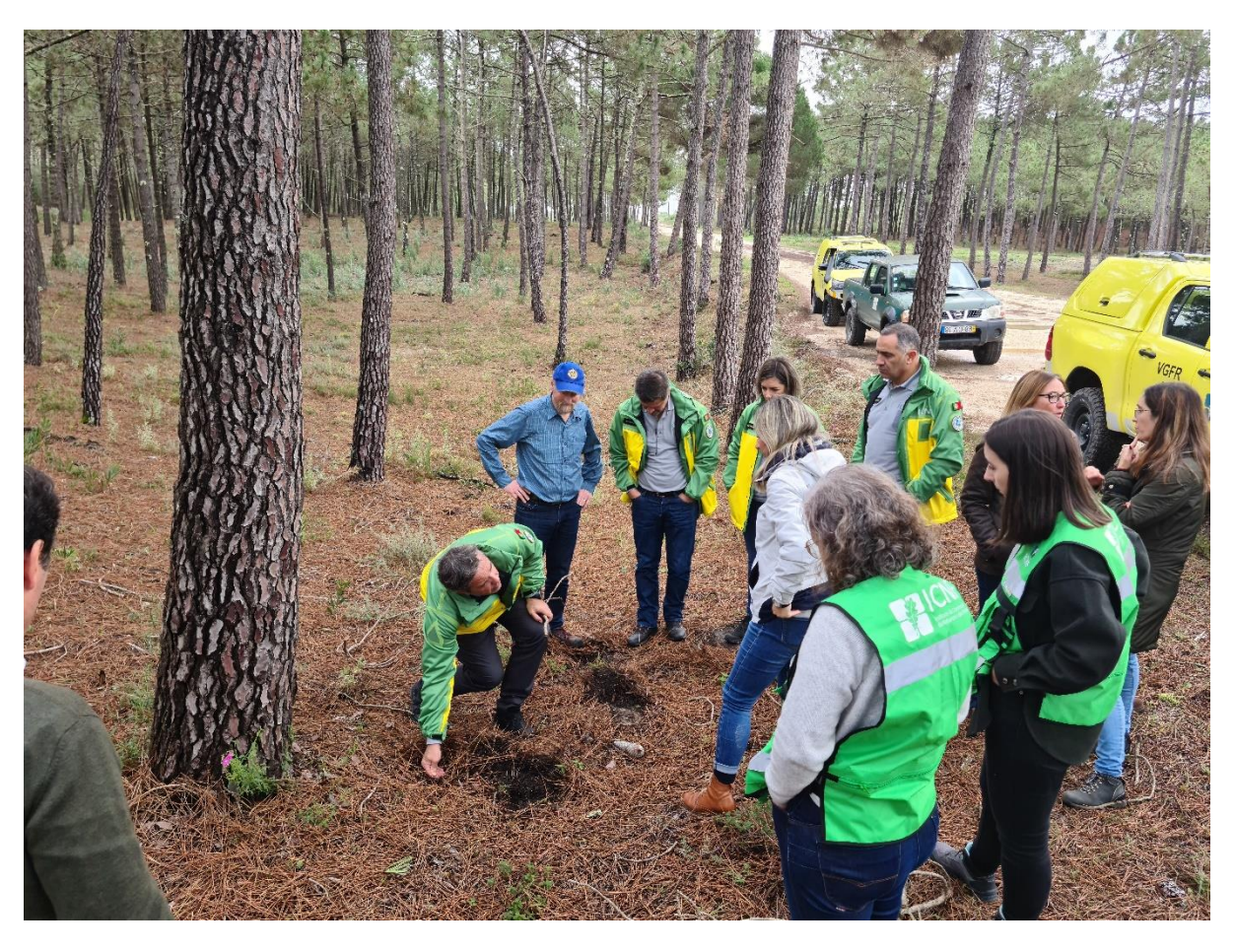
ICNF staff, Beira Litoral, Portugal.