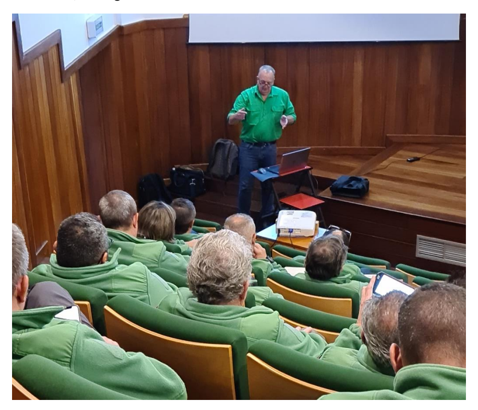
ICNF Fire Experts, Training Centre, Lousa, Portugal.