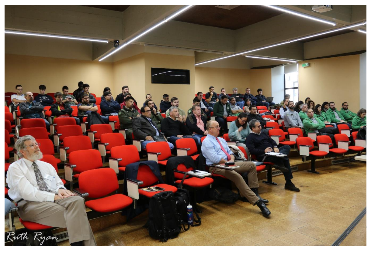
Politecnical School of Coimbra. Portugal.