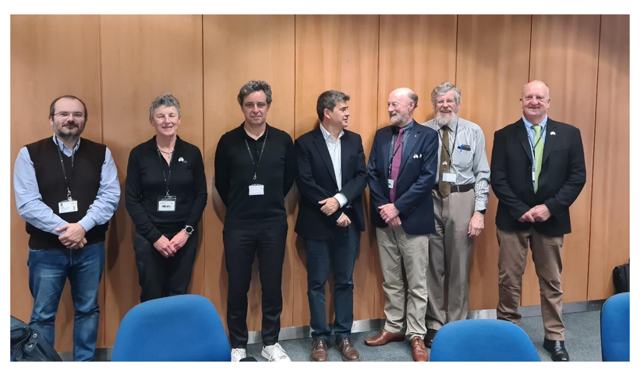
AGIF Board of Directors. Lisboa. Portugal