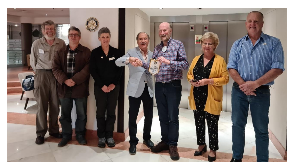
Rotarians from the Rotary Club of Coimbra.